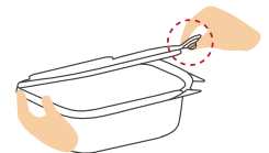
NO WASTE PIECE